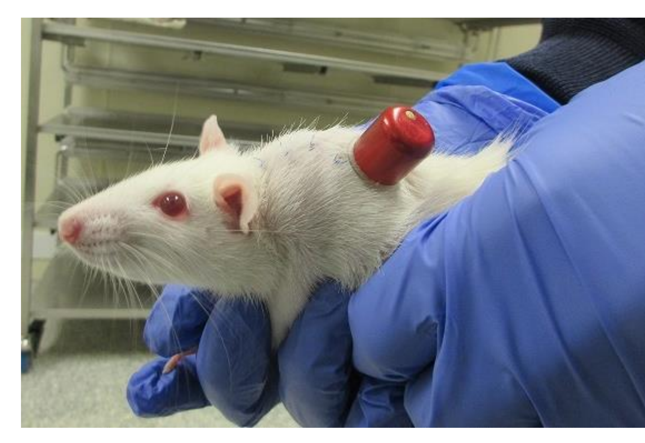
Figure 1. Seroma surrounding the VAB implant surgical site in a female rat, side view.